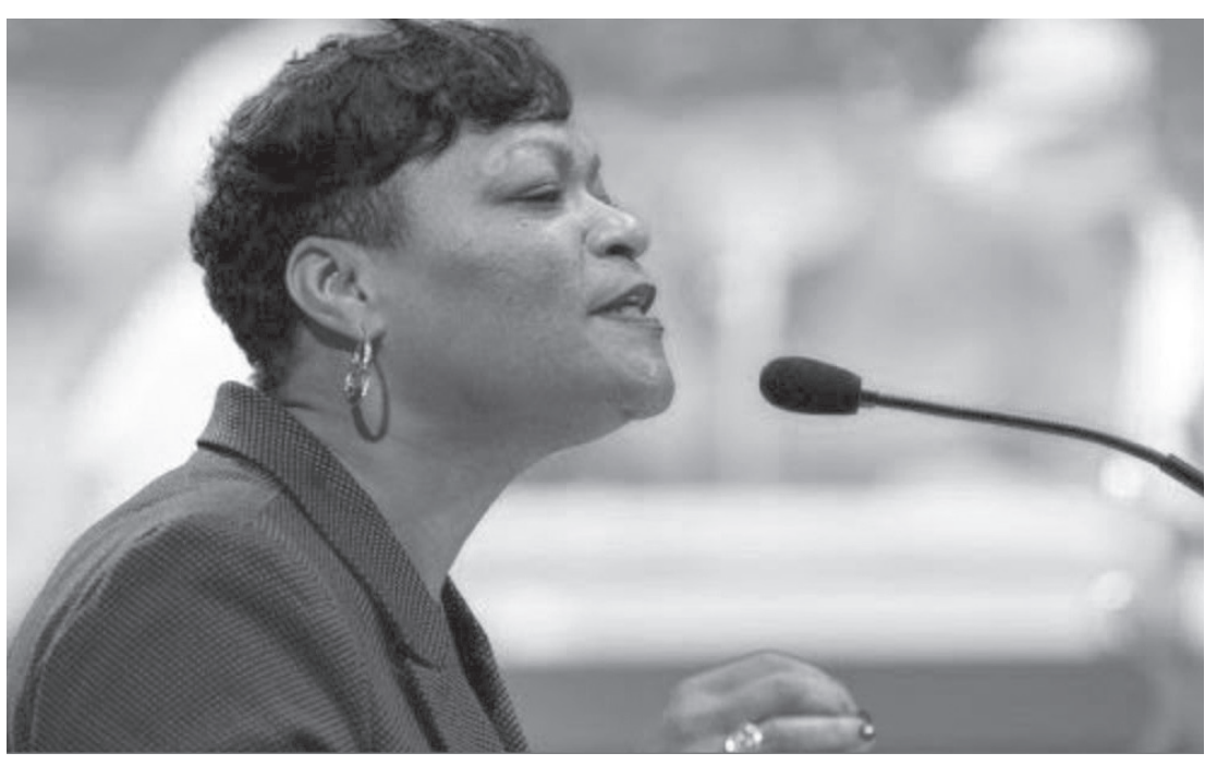
Mayor LaToya Cantrell

The mayor called those legal challenges a matter of voter protec-