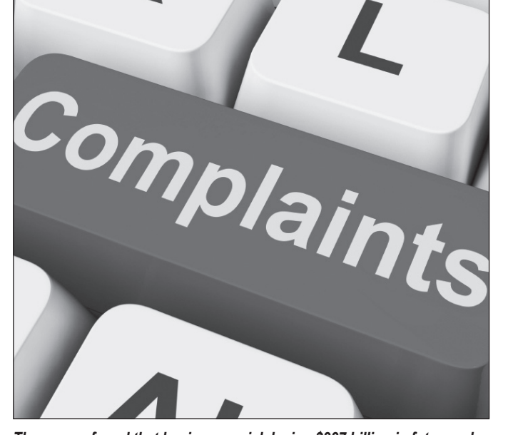
The survey found that businesses risk losing $887 billion in future sales because they handle customer complaints poorly.

43% cited a loss of money (an average loss of $1,261), and