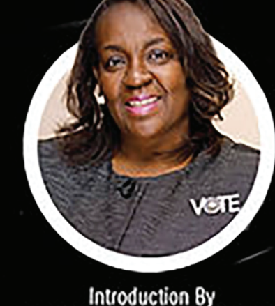
Introduction By SEN. REGINA ASHFORD BARROW Louisiana State Senate District 15