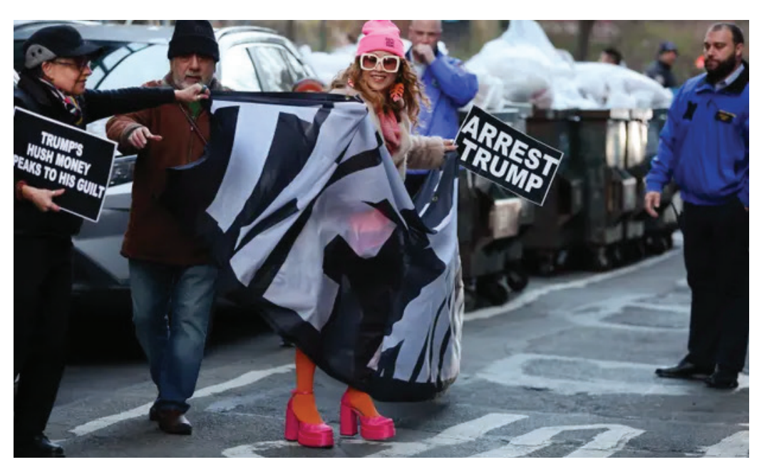
Police, media and protesters gather outside a Manhattan courthouse after news broke that former President Donald Trump has been indicted.

The Manhattan District Attorney's office confirmed the indictment, but the number of charges that Trump faces in the indictment was not disclosed. It is also not known whether the indictment is limited to conduct